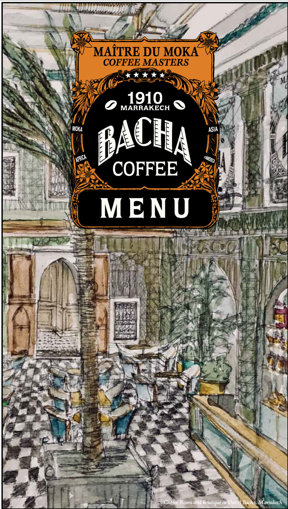
Coffee Room and Boutique at Dar el Bacha, Marrakech