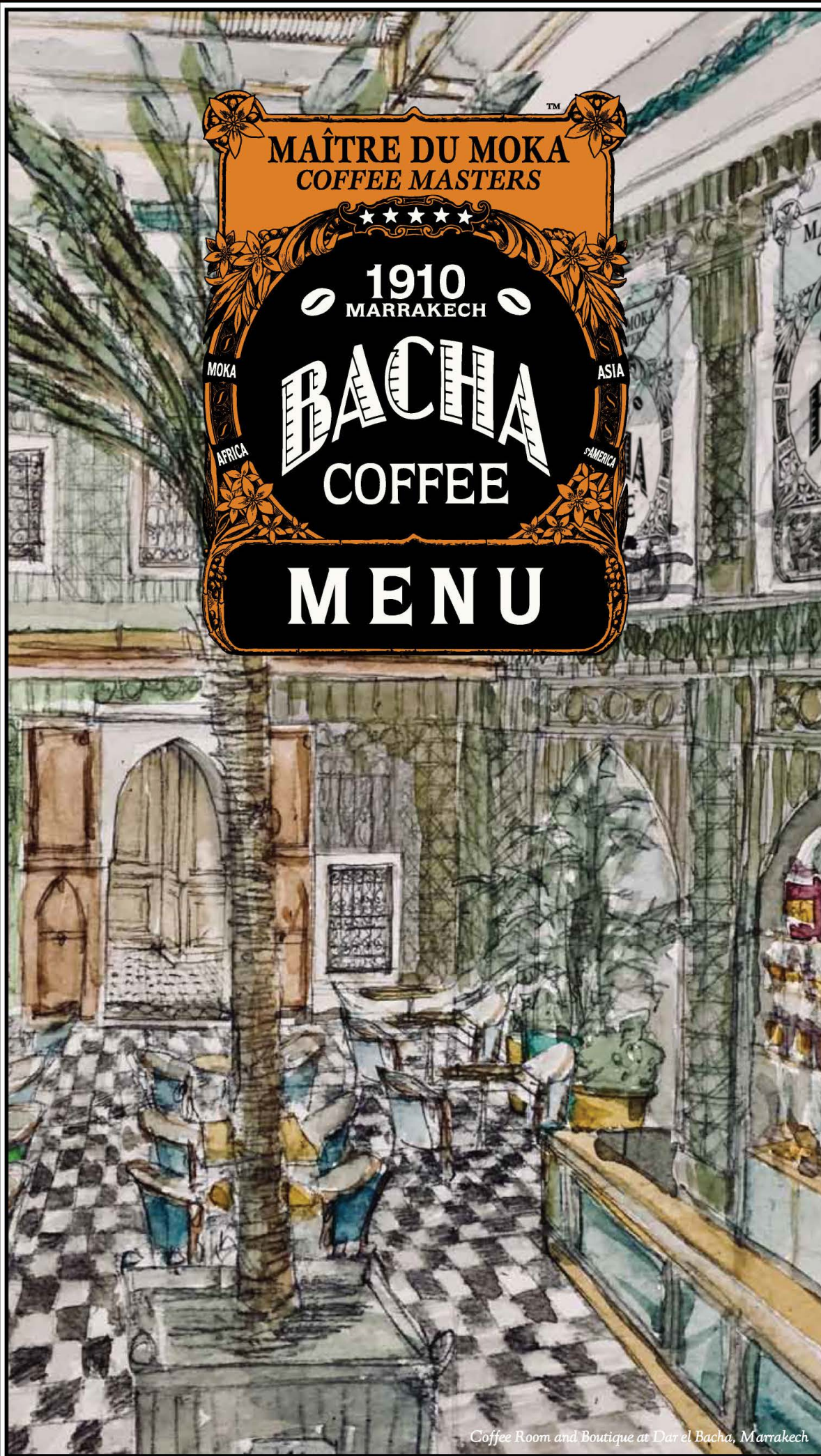
Coffee Room and Boutique at Dar el Bacha, Marrakech